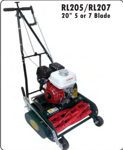
RL205/RL207 20" 5 or 7 Blade

COMMERCIAL QUALITY • PROFESSIONAL RESULTS