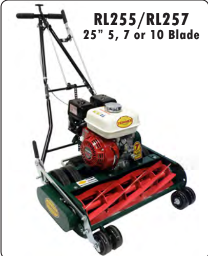
RL255/RL257 25" 5, 7 or 10 Blade