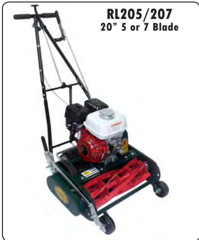
RL205/207 20" 5 or 7 Blade

COMMERCIAL QUALITY • PROFESSIONAL RESULTS